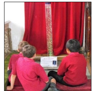
Some prayer space activities on our church visits

Each half term, all pupils are provided an opportunity to write a prayer or reflection focused on our Christian value. Pupils write this on a prayer fish (ichthys) which are displayed throughout the school; some pupils' prayers are then chosen to lead daily collective worship (there is a class rota). These fish are displayed on the beautiful wave mural at the front of the school and pupils are presented with a certificate of thanks by St Edmund's church.